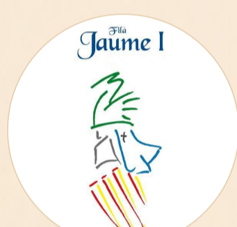
JAUME I (1977)